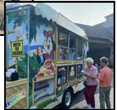
Second Place Winner!