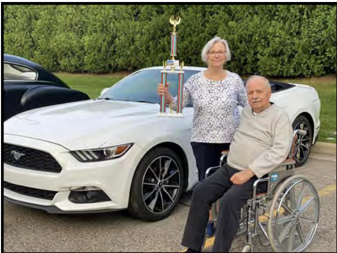
First Place Winner!